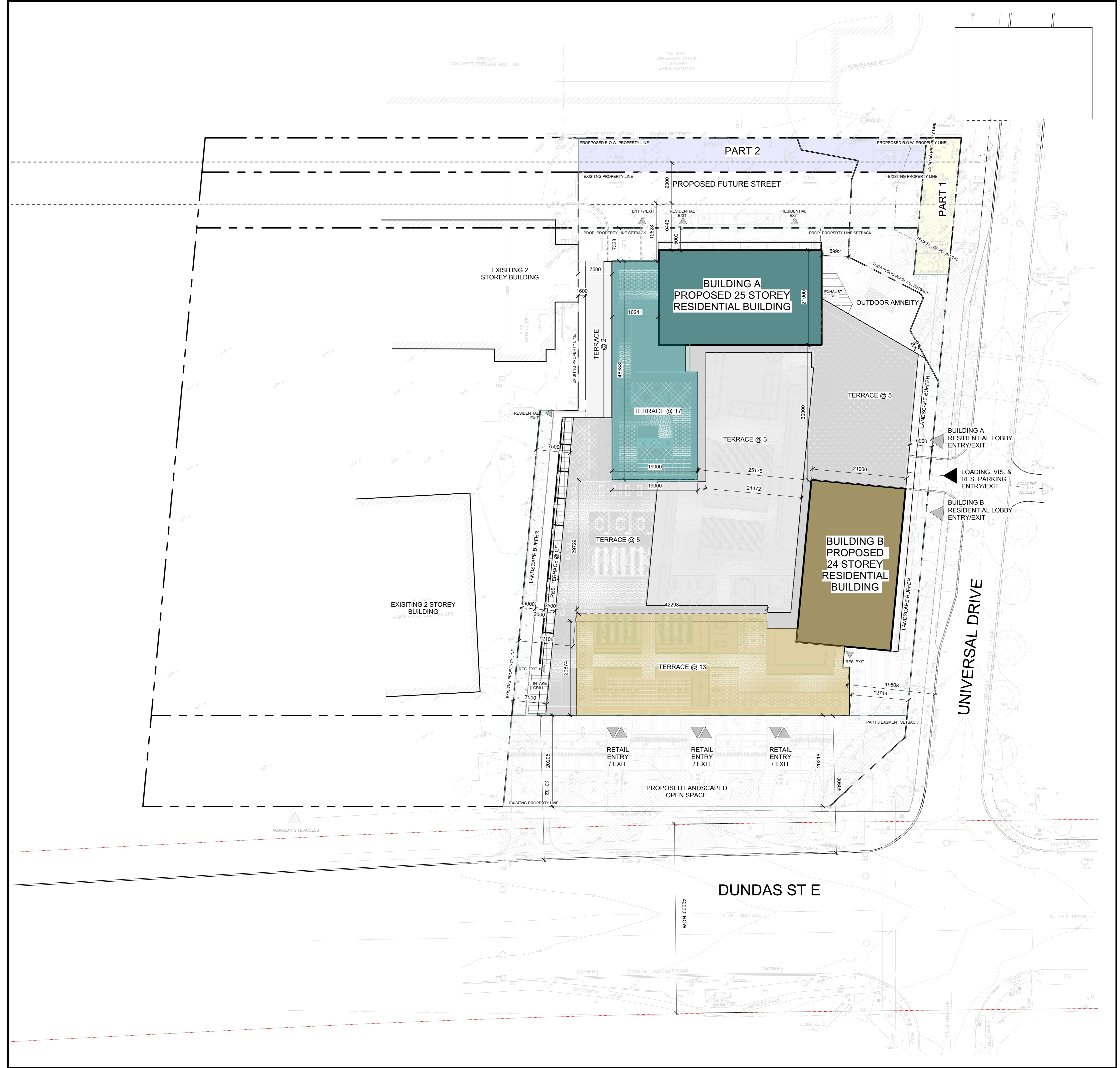
BUILDING B SITE STATS

THIS DRAWING IS THE PROPERTY OF THE ARCHITECT AND MAY NOT BE REPRODUCED OR USED WITHOUT THE EXPRESS CONSENT OF THE ARCHITECT. THE CONTRACTOR IS RESPONSIBLE FOR CHECKING AND VERIFYING ALL LEVELS AND DIMENSIONS AND SHALL REPORT ALL DISCREPANCIES TO THE ARCHITECT AND OBTAIN CLARIFICATION PRIOR TO COMMENCING WORK.