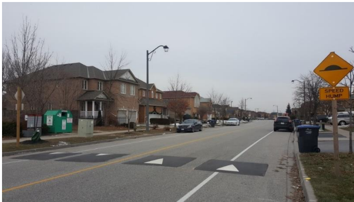
Speed Cushion- Twain Avenue

The speed cushion is the preferred traffic calming device to be installed on Willowbank Trail. A speed cushion is similar to a speed hump that does not cover the entire width of the road. Speed cushions are intended to allow for operating speeds of approximately 40km/h while allowing larger vehicles such as buses and emergency vehicles to pass without difficulty.