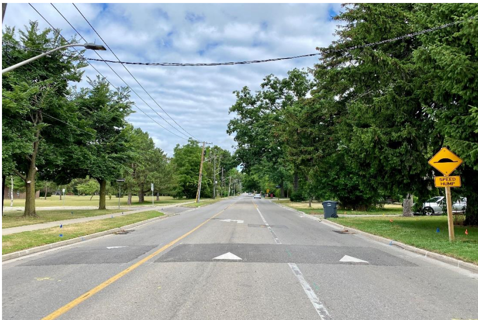
Split speed hump- Lorne Park Road

The split speed hump is the preferred traffic calming device to be installed on Golden Orchard Drive. A split speed hump is similar to a speed hump, however does not cover the entire width of the road. Split speed humps are intended to allow for operating speeds of approximately 40km/h while allowing larger vehicles such as buses and emergency vehicles to pass without difficulty.